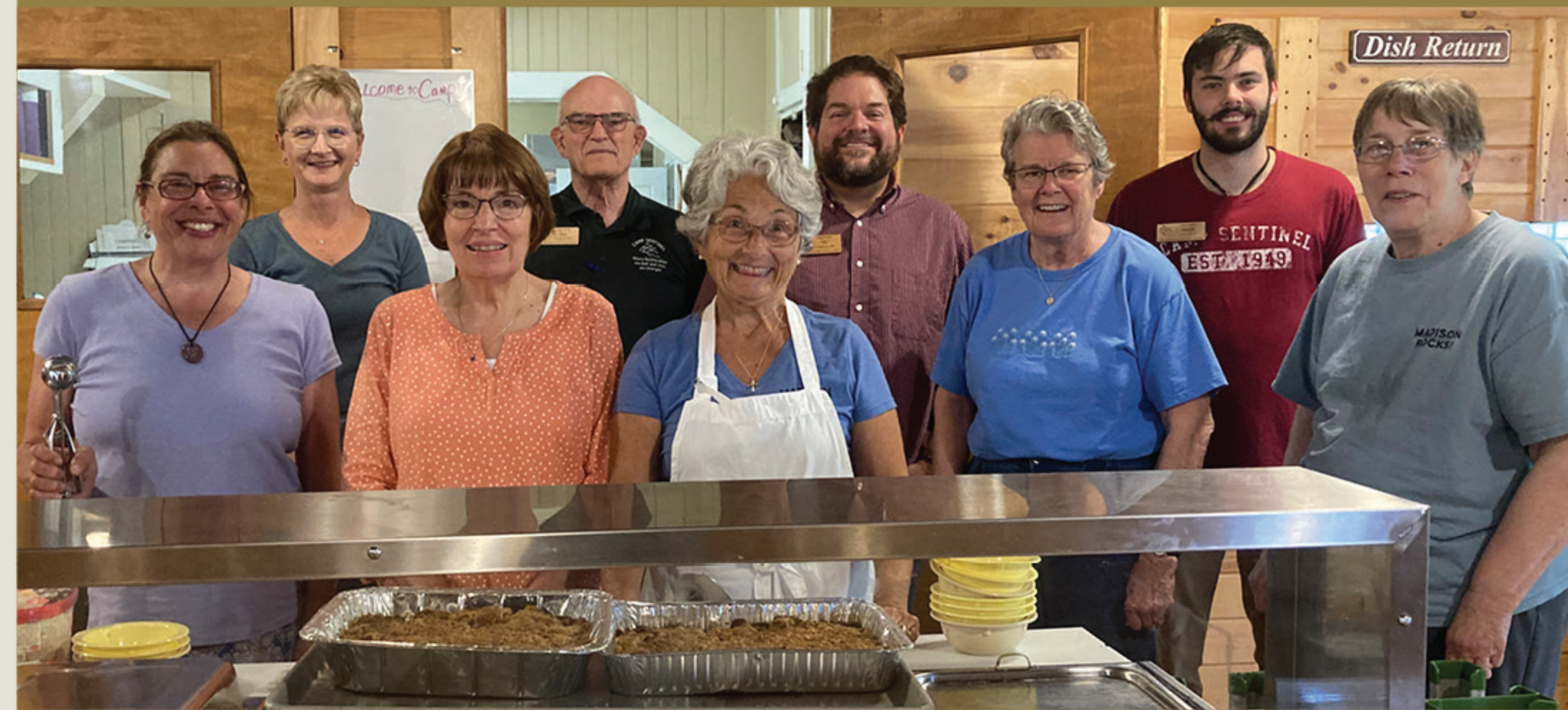
Local church group serving at camp.

Camp Sentinel staff typically come for 6 or 8 weeks, depending on position. Staff training is the third week of June, followed by five weeks of camp programming. August typically consists of group retreats which staff are able to stay to help with.